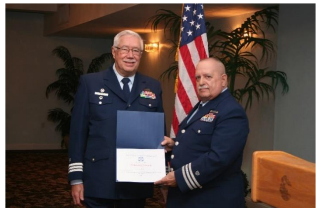
The “ Public Education Award ” is presented to the individual that has put in the most instructor hours in the field of Public Education during the award period which